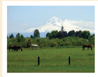
Residents enjoy a rural lifestyle.

Farming, dairy, nursery and real estate are currently the primary industries. Although new to development, well recognized business names are prevalent throughout the city. Major employers are Safeway, Bi-Mart and the Gresham-Barlow School District. There is also an abundant amount of home based or private wholesale, retail and service based businesses such as nurseries and farm stands.