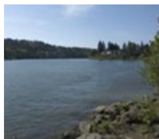
Access to the Willamette River is right downtown.