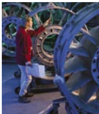
Milwaukie is home to a wealth of businesses from manufacturing to medical to comic books.