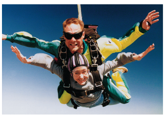
Molalla offers exciting opportunities.