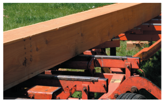
Forest Stewardship Council member Maple Grove Trading manufactures and brokers a variety of wood based products.

There are a number of existing industries in the Molalla area, with new expansions currently underway. With an easy access to either I-5 or I-205, Molalla is poised for industrial growth with available industrial land in its new Four Corners Industrial Park or in Avison's Certified Industrial Site.