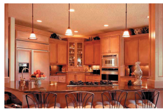
A Molalla employer since 1988, Brentwood Corp. is one of the country's most technologically advanced cabinet door manufacturers.